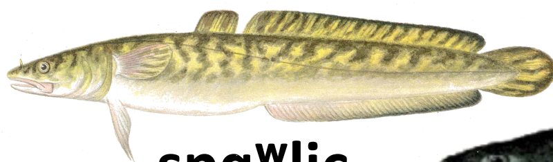
spq w lic (lingcod/burbot)