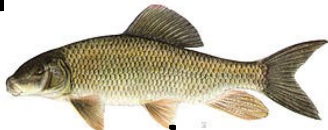
qix w íx (suckerfish)