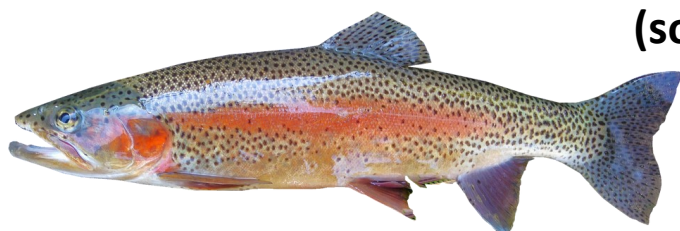
x w əx w mína? (trout)