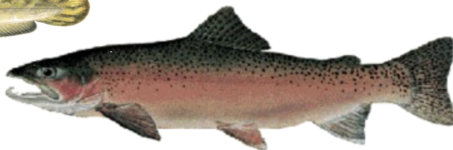
x w mína? (steelhead)