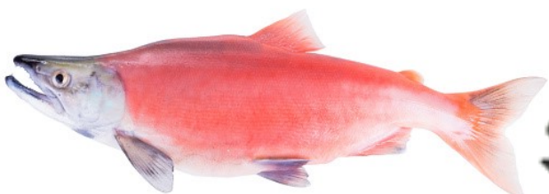
kək'ni? (kokanee salmon)